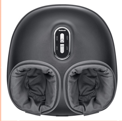
Foot massager and mini Theragun!

Visit our Expo Hall and attend sessions to earn raffle tickets! You must be in attendance at the closing session to claim your prize.